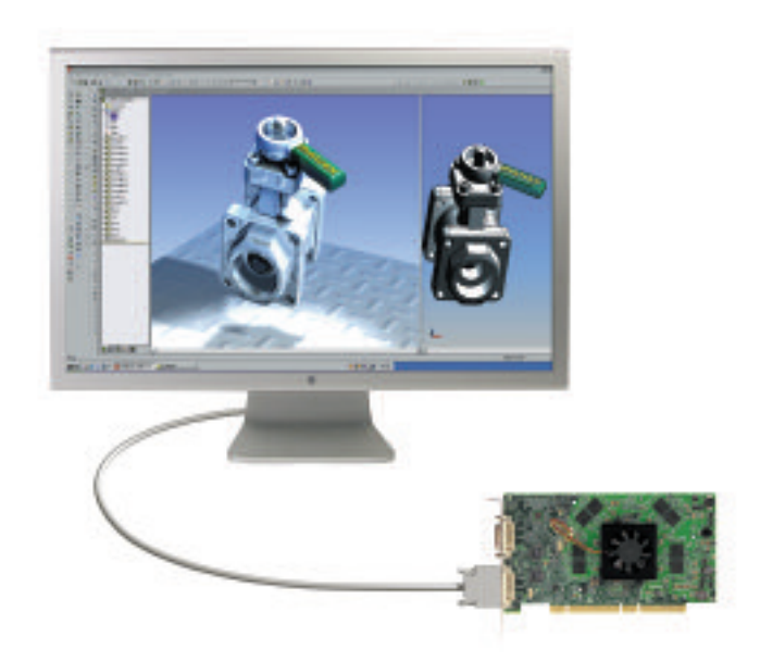
Matrox Parhelia DL256 PCI controlling a 30-inch Apple Cinema HD Display

The advantages of high-quality, high-resolution displays are best appreciated when seen for yourself. The Matrox Parhelia DL256 graphics card driving the 30-inch Apple Cinema HD Display® shows what's possible. This clean, space-saving, high-resolution solution is ideal for many professional work-stations and for PID. Matrox Parhelia DL256 brings support for this monitor and other dual-link monitors to Microsoft® Windows®- and Linux®-based systems.