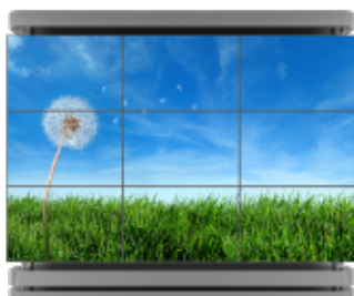
Video Wall Displays